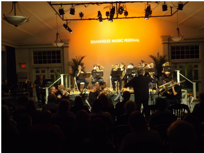
GBO at the Shandeelee Music Festival